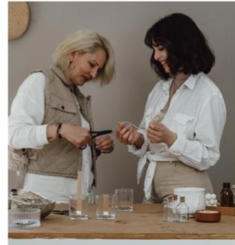
Happy International Women's Day! We are SO proud to have a team of amazing, strong, confident women. Who run the world? Girls! #WomensDay 💕