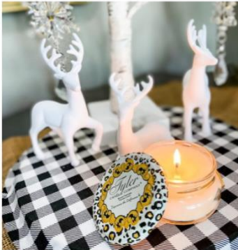
On the first day of Christmas, my true love said to me... One Glamorous Candle 🕯️ Happy December 1st! We have our advent candle burning.