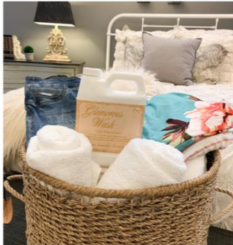
It's World Sleep Day! 🌙 Here's our top tip: wash your sheets in our Glamorous Wash detergent for the BEST night sleep you've ever had 🤪 #SelfCare